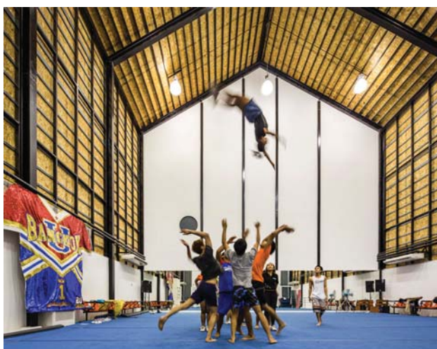
Cheerleader training at Bangkok University

Chiang Mai is on top of the wish list of almost every foreign visitor to Thailand, and so is Chiang Mai's Sunday Market. We fly to Chiang Mai in the morning, thus having time for a guided City Tour in the afternoon, before ending the day on the Sunday Market when the heat of the day is gone. The next day, you will get in touch with elephants big and small, and enjoy the most famous attraction that Northern Thailand has to offer: River Rafting.