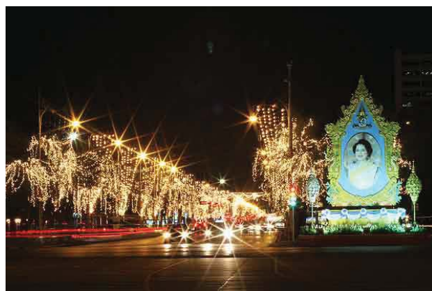
Street decoration in Bangkok at HM the Queen's Birthday

During the first three evenings, we will invite you to different Thai restaurants and eateries in order to make you familiar with Thai dishes. Nothing is more frustrating than standing hungry in front of a food stall but not knowing whether you could eat what you see there. You will taste Central, Northern and Southern Thai dishes and learn how to pronounce the names of those dishes you like best. Certainly, we will also introduce you to Isaan Food, the dishes from the Northeast of Thailand.