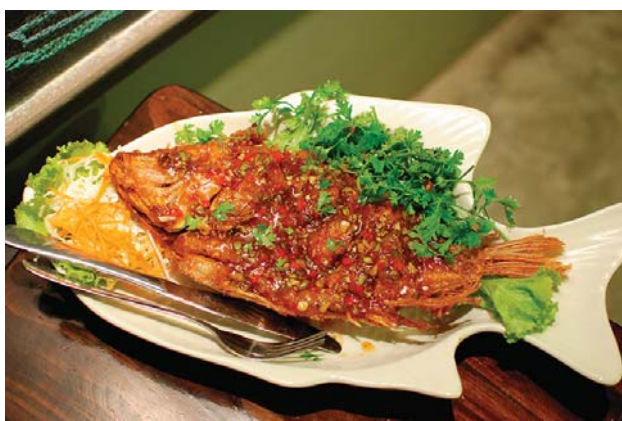
Pla Tod Sam Rod - a tasty Thai dish

In chronological order, we want to give you an overview of why some elements became integral part of this unique Summer University program.