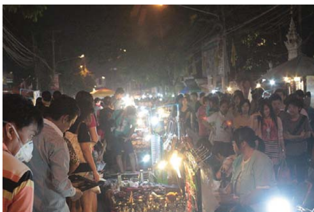
Chiang Mai Night Market

After the company visit, you will go back to Bangkok on a wooden boat along the shores of Chaophraya River, especially impressive when darkness falls.